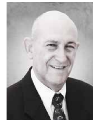
Colonel (Res.) Rami Efrati