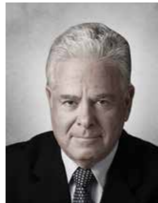
General (Res.) Dr. Efraim Sneh, M.D