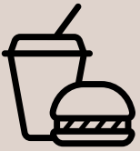
Food & Beverages

Halal Trade, Logistics and Manufacturing Expo will further strengthen Africa's position as a global halal hub and put forward the economic values of Halal for the world.